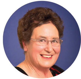
Tena Koutou katoa. The Masonic Villages Trust needs you!