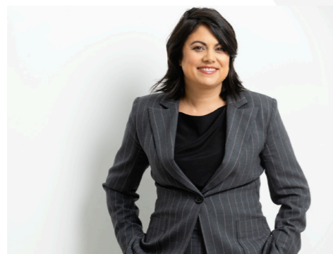
Dr Ayesha Verrall

The current system to ensure quality and safety in the sector is fragmented, and it can be complicated navigating services to get help.