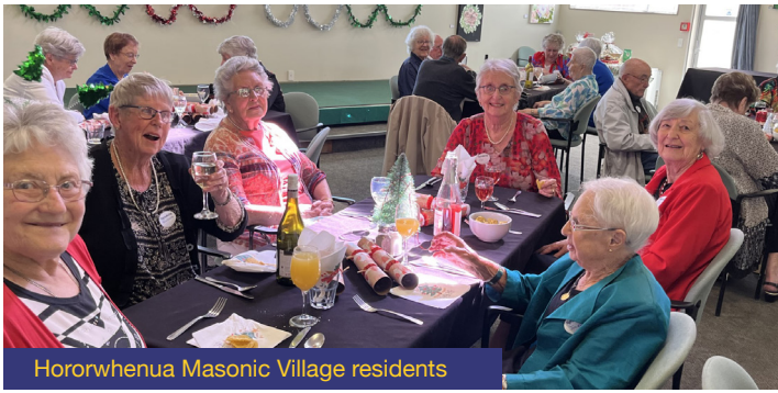
Horowhenua Masonic Village residents