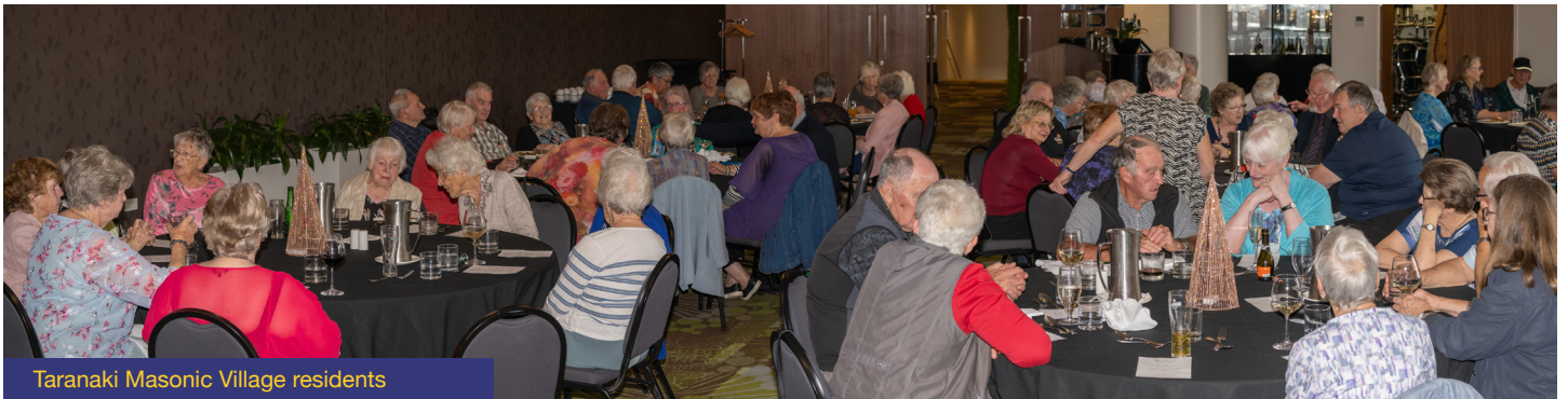
Taranaki Masonic Village residents

Masterton and Wharekaka Villages are very busy in December with Christmas dinner at Lansdown House and Christmas lunch at the Village HUB, the Brass band will be doing carols in Masterton, while Rotary will be at Wharekaka doing carols. A remembrance service will also be held at Wharekaka.