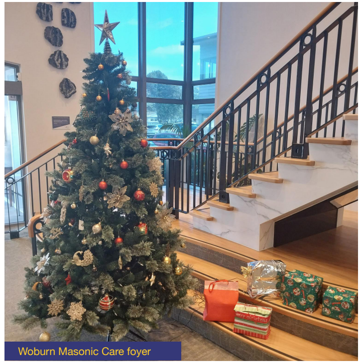
Woburn Masonic Care foyer