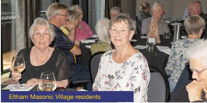
Eltham Masonic Village residents